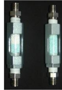
Figure 1. SulfaTrack™ indicators; the indicator on the left capable of speciating COS (VI indicator) and the indicator on the right without COS detection capability (V1 indicator).

Replacement cartridges for all indicator types listed above are available for order. These replacement cartridges include replacement gaskets and O-rings to ensure a leak free seal upon replacement.